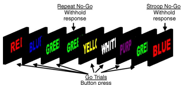
Fig. 1. The Error Awareness Task required subjects to respond with a button press to a stream of colour words and withhold their response when either a word was repeated on consecutive trials or the font and word were incongruous. Subjects were trained to press a different button following any commission errors.

All analyses were conducted using AFNI software (Cox, 1996). Following image reconstruction, the time-series data were time-shifted using Fourier interpolation to remove differences in slice acquisition times and motion-corrected using 3D volume registration (least-squares alignment of three translational and three rotational parameters). Activation outside the brain was also removed using edge detection techniques. No subjects showed